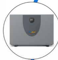
Reverse Fan Patent Design