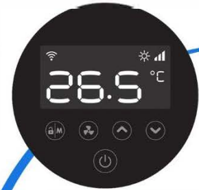
Premium Touchpad Controller