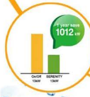
Double Your Energy Savings

*Performance conditions: The data above is only for reference. For specific data, please refer to the heat pump nameplate or please speak with an EZIHEAT specialist. Specifications are subject to change without notice.