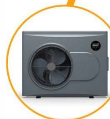
Front Airflow Design