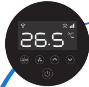
Premium Touchpad Controller