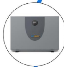
Reverse Fan Patent Design