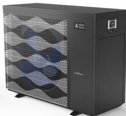
Front View on angle with side showing LCD touch screen