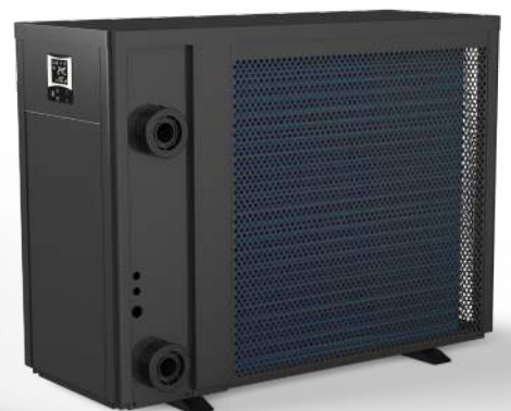
Back View on angle with side showing LCD touch screen