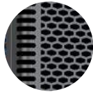
Patented Aluminium Alloy Casing