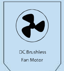
DC Brushless Fan Motor