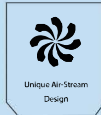
Unique Air-Stream Design